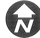
Diagram Not to Scale

RANGIORA-ASHLEY COMMUNITY (BOUNDARY IS THE SAME AS RANGIORA-ASHLEY WARD SEE LG-059-2016-W-3)